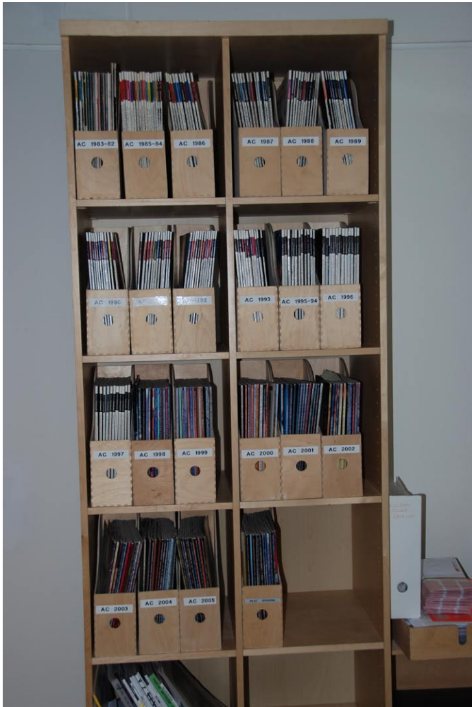
Blixt's library includes the largest collection of "American Cinematographer" in northern Europe.