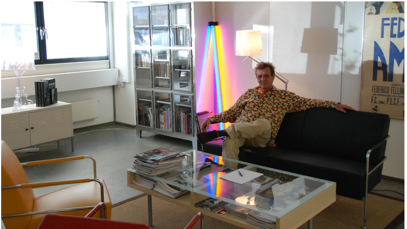
The well-stocked library is larger than most university film studies collections, and includes Vittorio Storaro's trilogy (background, left).