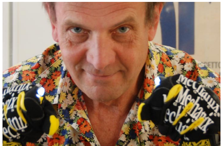
The very cool Blixt expendables department carries these sci-fi looking, but actually very useful, grip gloves with built-in LED flashlights. Sewn into the prehensile fingers are LEDs and batteries. Perfect for night shoots or dark Scandinavian winter days.