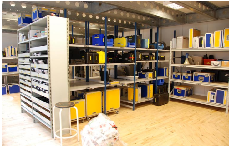
Equipment storage area: Aaton, Arricam, Red, Angenieux, Cooke, Zeiss and much more.