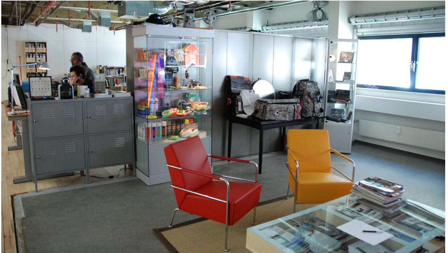
Below: Expendables, library and reception area.