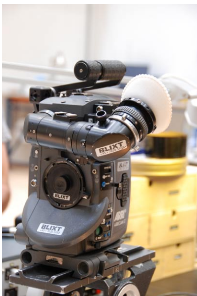
Resa Farsangi prepping an Arricam Lite.