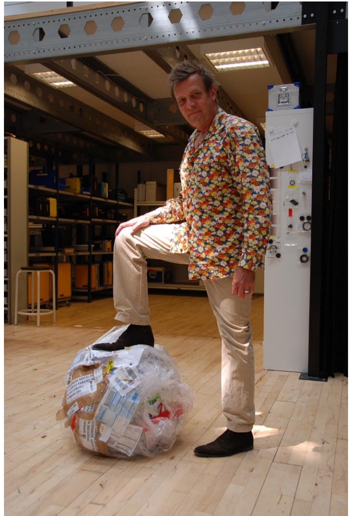
Ball of sticky labels scraped off of cases. Blixt the Great Dictator...er...Decorator?